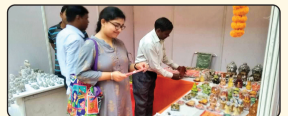
8. Exhibitions of ODOP, NMCG & Handicraft