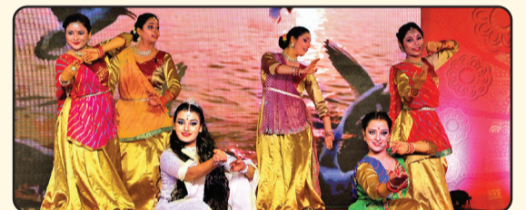
5. Cultural Performances