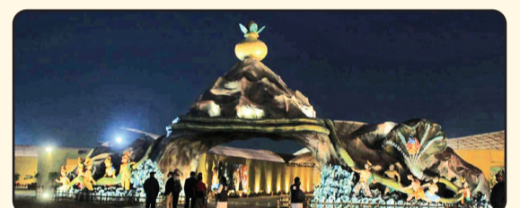
6. Sanskriti Gram