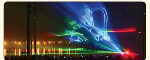
4. Water Laser Show