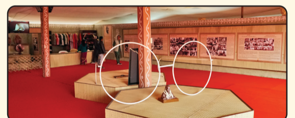
7. Kala Gram