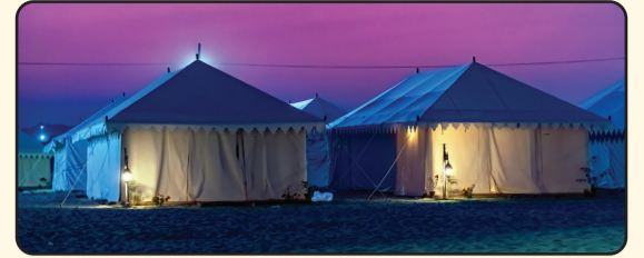
1. Tent City