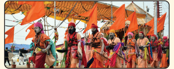
2. Mahakumbh Akhara Tour