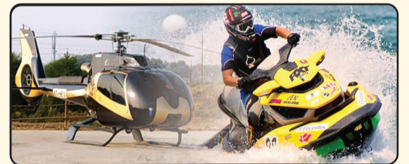
3. Helicopter Rides/Water Activity