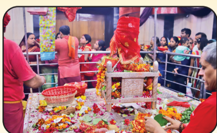
Alop Shankari Devi Temple