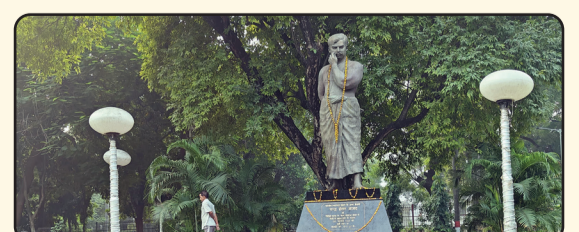
10. Heritage Walk