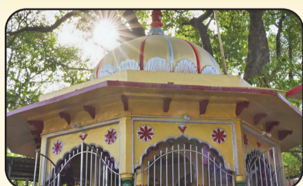
Mankameshwar Temple Corridor