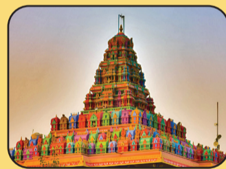
Shankar Viman Mandapam