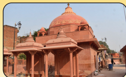
Bharadwaj Ashram Corridor