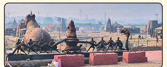
9. Shivalay Park