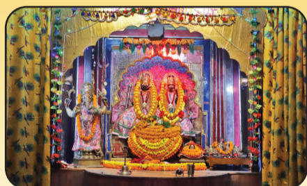
Dwadash Madhav Temple